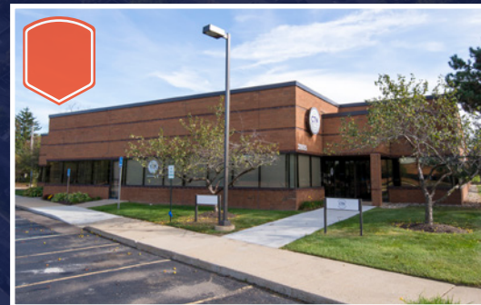
Eisenhower Corporate Park 2725 S. Industrial Hwy 7,292 - 14,494 SF Available $14.00 PSF (NNN)