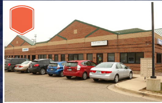
510-532 S. Maple Rd 4,258 SF Available $18.00 PSF (MG)