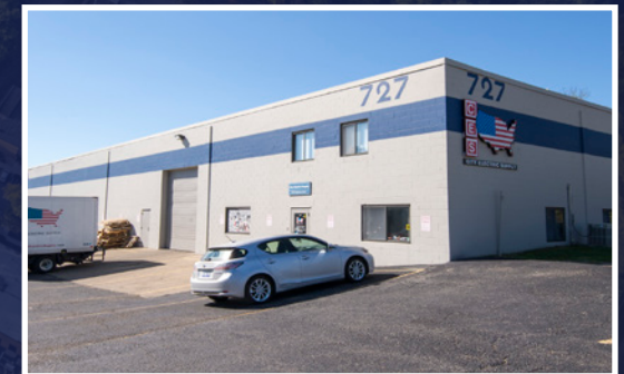
Oxford Commerce Park 719 - 727 W. Ellsworth Rd 5,886 SF Available $8.95 PSF (NNN)