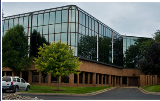
Atrium I 900 Victors Way 440 - 4,100 SF Available $26.50 - $32.73 PSF (MG)