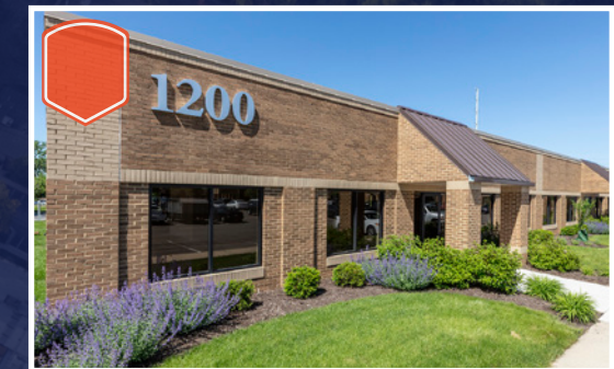
Atrium V & VI 1200 - 1300 Victors Way 4,689 - 21,187 SF Available $14.00 PSF (NNN)