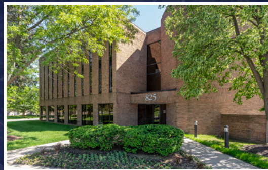
825 Victors Way 1,064 - 4,214 SF Available $23.50 - $26.50 PSF (MG)