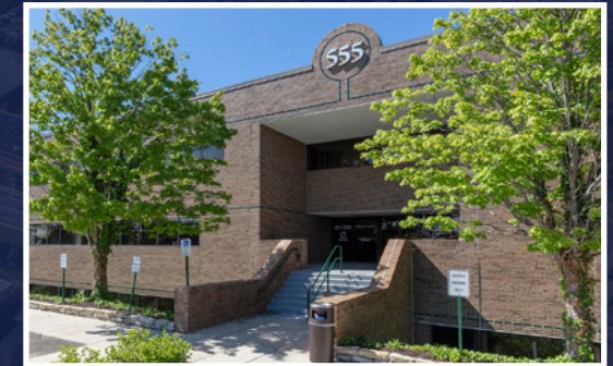
555 Briarwood Circle 1,180 - 6,171 SF Available $23.50 PSF (MG)