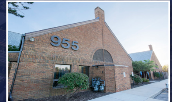
955 W Eisenhower Circle 1,248 SF Available $25.00 PSF (MG)