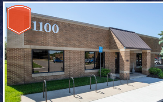
Atrium IV 1100 Victors Way 8,197 SF Available $15.00 PSF (NNN)