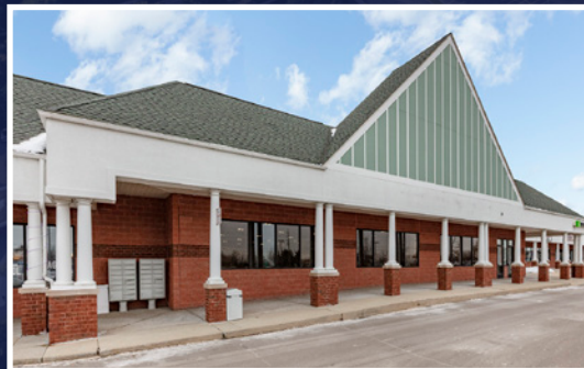
Dexter Crossing 7001 - 7093 Dexter Ann Arbor Rd 3,409 - 15,500 SF Available $9.00 PSF (NNN)