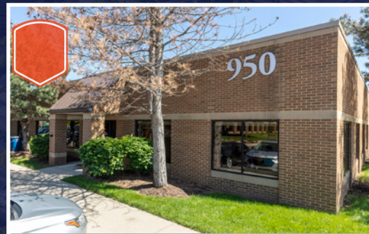
Atrium III 950 Victors Way 2,203 - 3,866 SF Available $14.00 PSF (NNN)