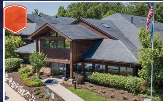
Forest Cove 3001 - 3035 Miller Rd 733-20,816 SF Available $19.95 PSF (NNN)

Oxford's Commercial team is happy to answer any questions you may have.