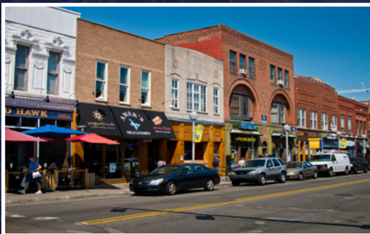
South State St 304 - 310 S. State St 162 - 1,658 SF Available $25.00 - $60.00 PSF (MG;NNN)