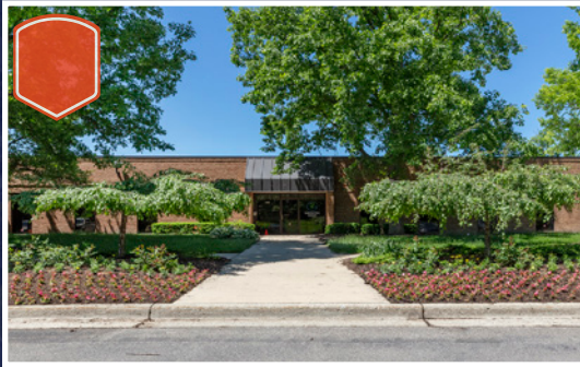
Eisenhower Commerce Center 1300 - 1390 Eisenhower Place 6,321 SF Available $15.00 PSF (NNN)