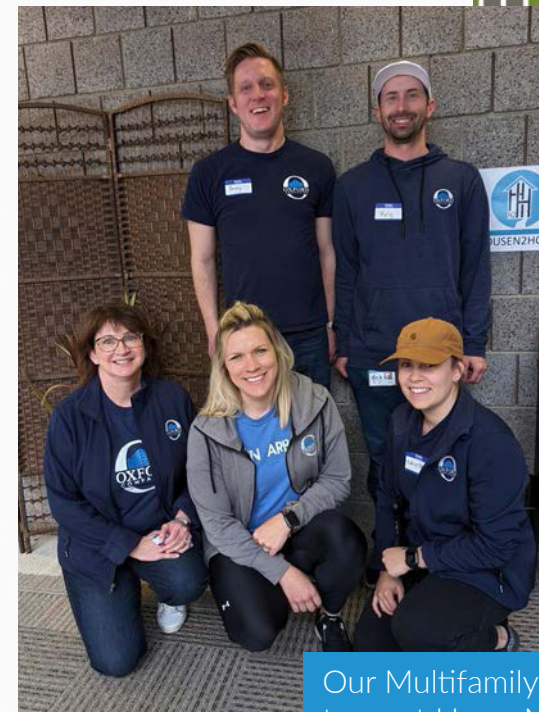
Our Multifamily Property Management team at HouseN2Home

Oxford place second in this years Amazing Race!