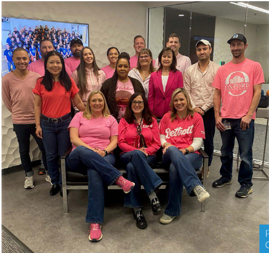
Pink Out Day for Breast Cancer Awareness